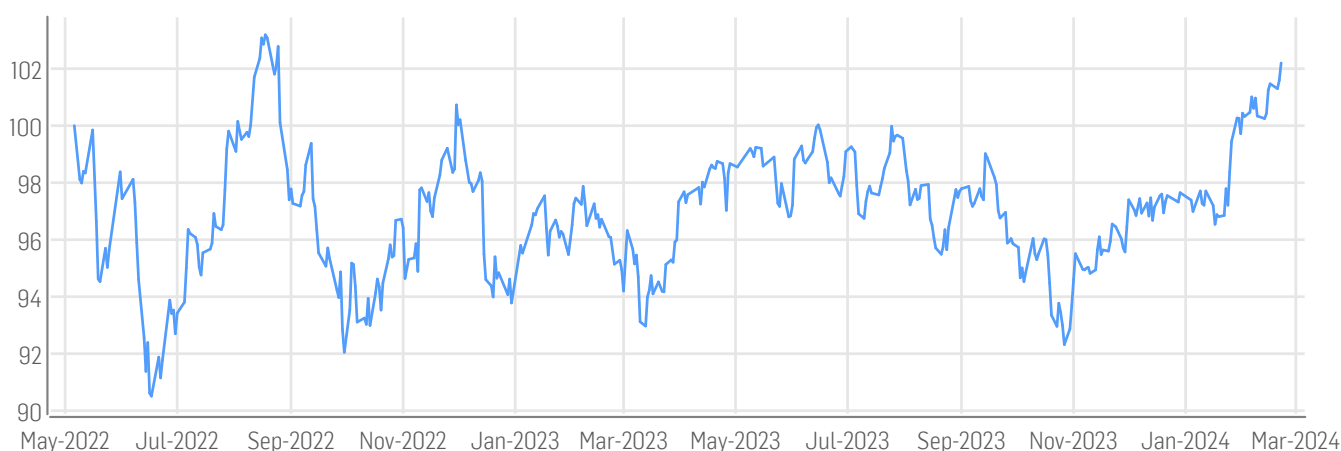
■ Börse Online Aktien für die Ewigkeit Index