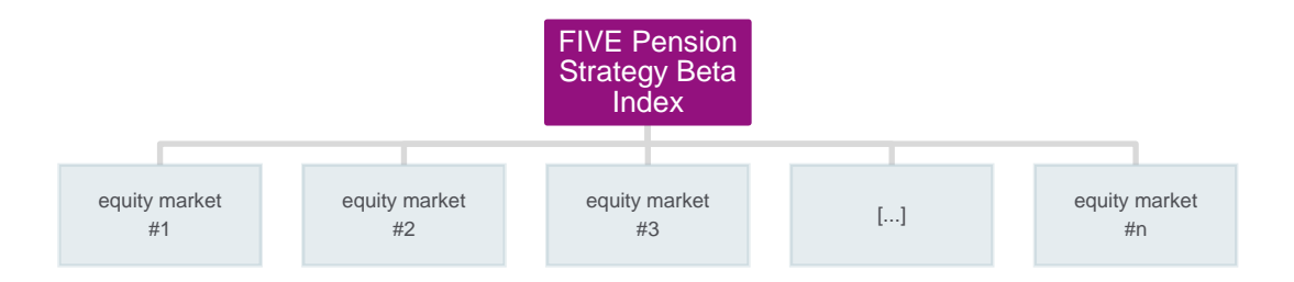
Figure 2: Index-structure BETA

The FIVE Pension Strategy Equity Beta Index aims at tracking global developed equity markets while aiming at keeping a constant volatility level over time. It combines several blue chip equity index markets into one portfolio. The portfolio is long-only and has a fixed allocation. The target weights are provided in Table 1. Rebalancing and reweighting events occur on a monthly basis. The rebalancing process is carried out at the beginning of each calendar month. All non-EUR components are hedged into EUR on a daily basis.